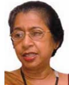
Rose Cooray Former Deputy Governor Central Bank of Sri Lanka